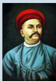
VAMAN SHIVRAM APTE