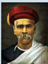
GOPAL GANESH AGARKAR