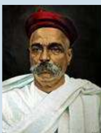
LOKMANYA BAL GANGADHAR TILAK