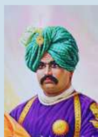
RAJARSHI SHAHU MAHARAJ

The Deccan Education Society (DES) holds a revered place in the history of education in India. Established on 24th October 1884, in the city of Pune, Maharashtra, the society has completed a glorious journey of 139 years, leaving an indelible mark on Indian society. Founded by a group of visionary leaders and social reformers, including Gopal Ganesh Agarkar, Vishnushastri Chiplunkar, and Bal Gangadhar Tilak, the DES has been instrumental in transforming the educational landscape of the country.